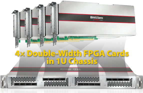
4x Double-Width FPGA Cards in 1U Chassis

This innovative product supports PCIe Gen5 and features an AMD EPYC processor in a standard rack depth chassis.